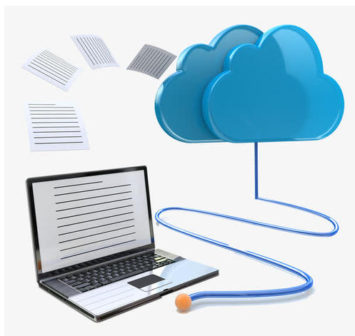
Figure 3 Big data era

In the era of big data, computer major in colleges and universities should pay attention to cultivating students' ability of data resource processing in practical teaching, which is the technical ability that the social employment market urgently needs computer talents to master under the background of big data era[4]. Therefore, in the practical teaching of computer training, we should pay attention to setting up practical training courses on data collection and analysis, storage management, accurate search, platform development and cloud computing, so as to enhance students' ability to deal with big data. In the process of practical teaching, we should focus on cultivating students' practical operation ability, let students deeply understand the theoretical knowledge of computer major in the operation of practical training projects, and improve students' ability to use computer technology to process and analyze data[5]. In order to meet the big data era talent market for computer professionals. For example, in the process of practical teaching, teachers can arrange students to choose large-scale network service industry for independent technical simulation operation practice training based on the big data knowledge of "Hadoop» course ", so that students can combine computer theory knowledge with practical operation to improve students' comprehensive practical ability.