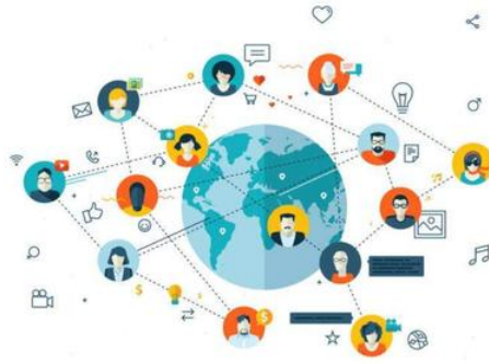
Figure 1 Big data era